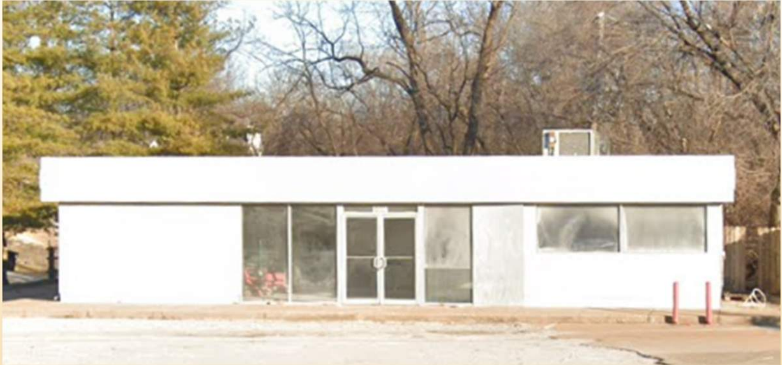
Namaste Yoga Studio (before) 10921 Manchester Road