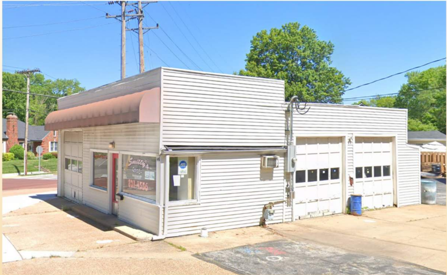
Smitty's (before) 449 Peeke Avenue